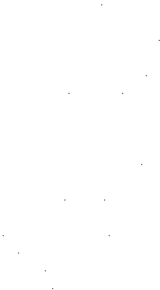
Figure 1. Scatter plot showing the relationship between the number of children, the number of children in the household, and the number of children in the neighborhood.